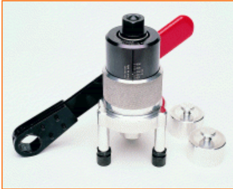
Elcometer 106/6 Coatings on Concrete Adhesion Tester