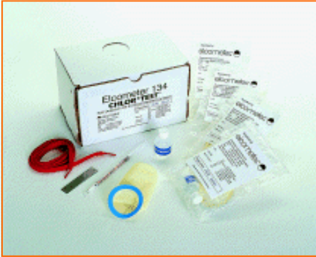
Elcometer 134S Salt Detection Kit for Blast Cleaned Surfaces