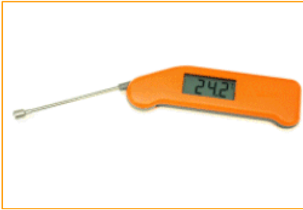
Elcometer 212 Digital Pocket Thermometer with Surface Probe