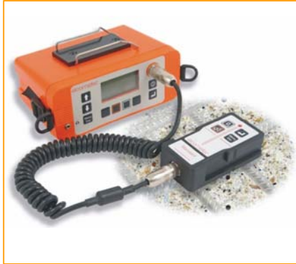
Elcometer 331 2 Covermeter with Half-Cell

This easy to use gauge not only quickly and accurately identifies the location, orientation, depth and diameter of rebar, but also the potential for corrosion.