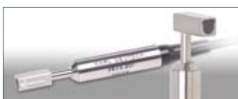
0°-probe and measuring head of the 90°-probe: Various designs for different shapes of workpieces.