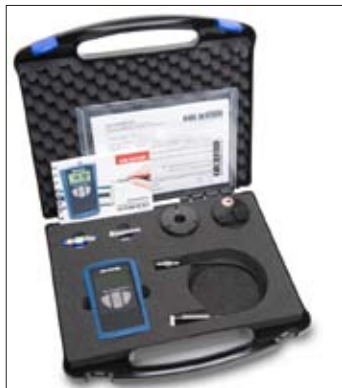
Delivery in a handy carrying case together with a detailed instruction manual and a quality test certificate (image shows sample assembly)