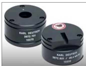
Accessory: Zero Field Chamber (left) with field-free space and Reference Magnet (right) for check of instrument.