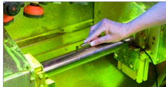
Example on application: Measurement of tangential field by means of the 90°-probe at field flow

For optimal adaptation to the geometrical conditions you can choose between a 0° and a 90° measuring head. An alternative, paraffin-resist-