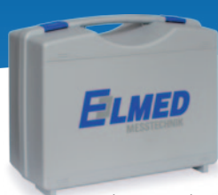
Incl. transport box