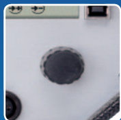
„Intelligent“ one-button operation