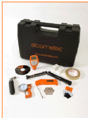
Inspection Kit 2

All the gauges are conveniently stored in one hard plastic protective carrying case and are supplied with full operating instructions.