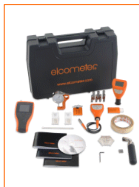
Inspection Kit 3