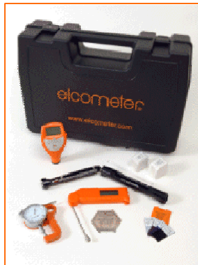
Inspection Kit 1

The Elcometer range of Protective Coatings Inspection Kits provide all the tools required for onsite inspection of a coating, including surface profile, dewpoint, relative humidity and both wet and dry film thickness.