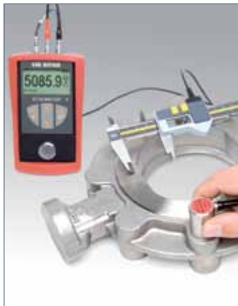
Measurement of sound velocity with connected caliper for automated input of the wall thickness value