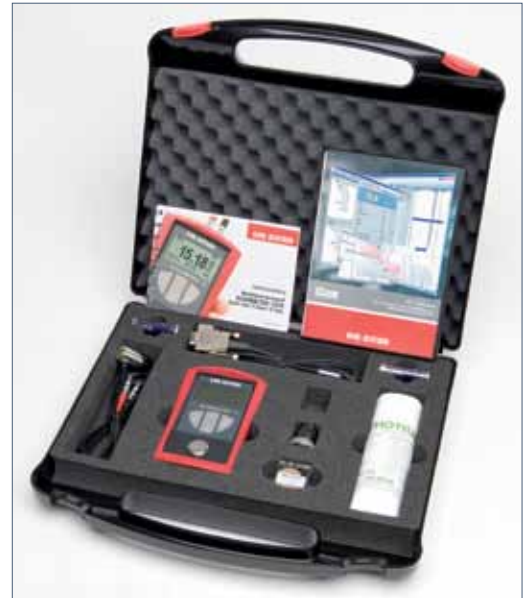
Delivery in a handy carrying case