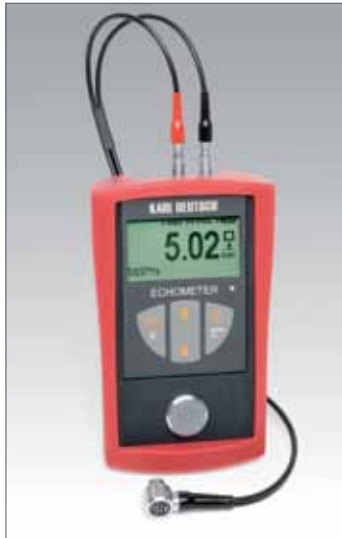
Large, clear graphic display with bright background illumination